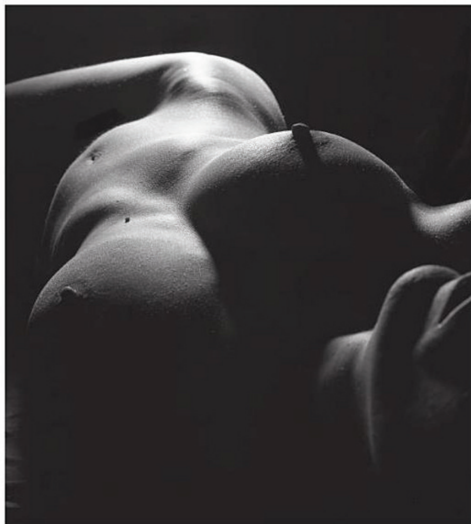
Curtis Neeley, Untitled